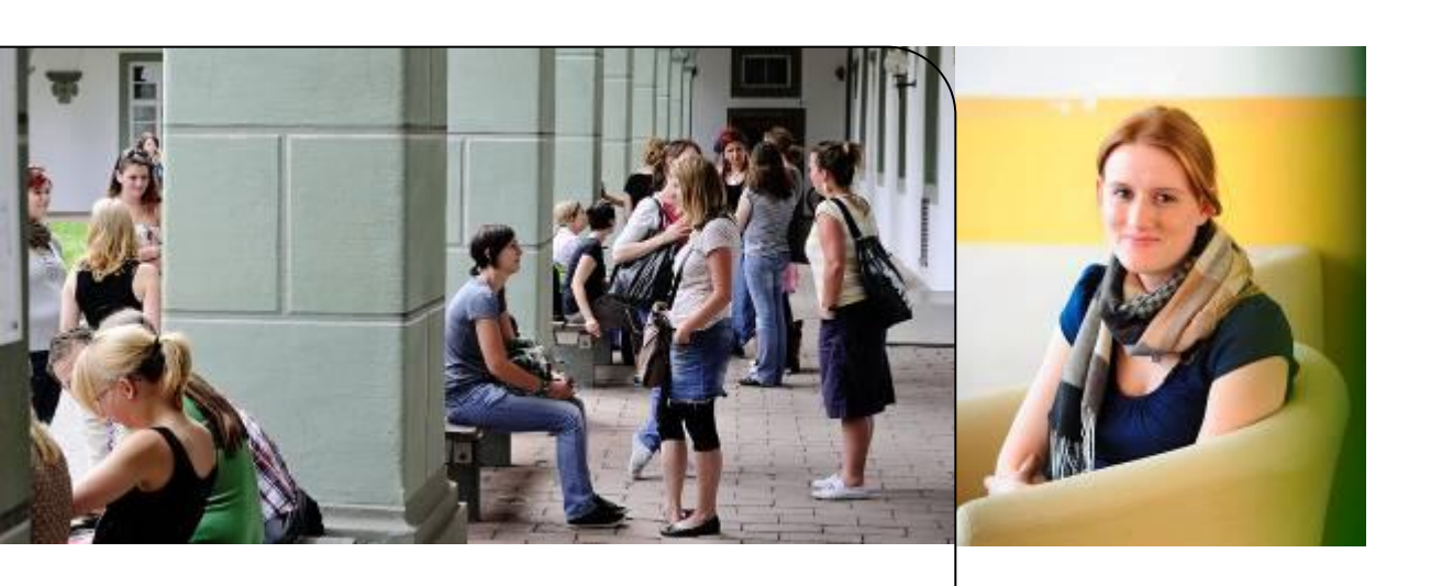
Focus on the Person: Study and Work at KSFH